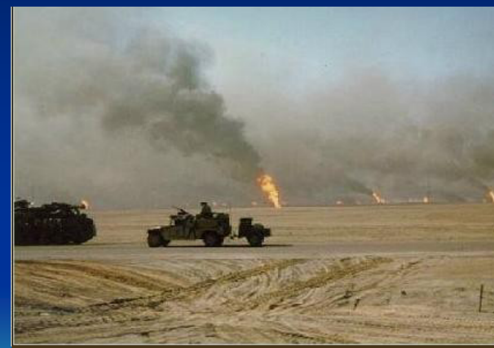
GULF WAR – US PERSONNEL IN FRONT OF BURNING KUWAITI OIL WELLS

GULF WAR – ENGINEERING SUPPLIES BEING SHIPPED IN